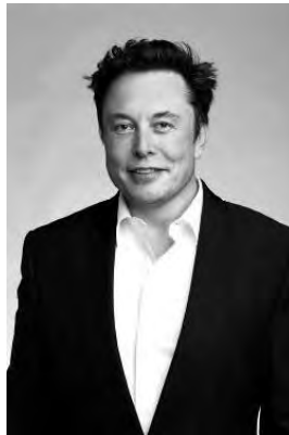
Figure 1: https://en.wikipedia.org/wiki/

14. Identify the following famous creative thinker and identify what they are famous for.